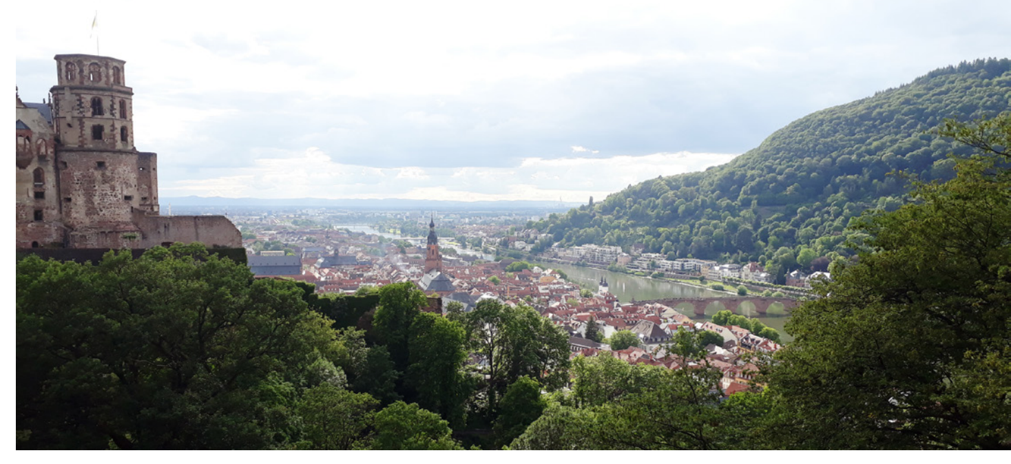
View from the Heidelberg Castle (image above)